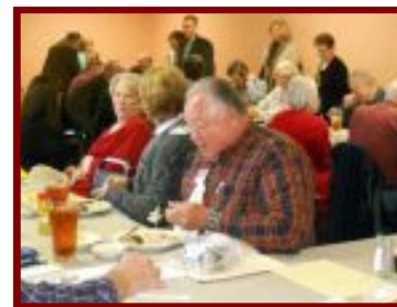
Lunch @ Phil's February 8th

February 18th - Breakfast Meeting 9:30 a.m. Phil's Restaurant National Issues