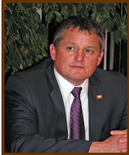
State Congressman Bill Westerman

AR State Congressman Bill Westerman was our guest at the February 8th Property Rights Alliance meeting. From a simple reading of portions of the Arkansas Constitution it became clear to the 35 people in attendance that the ETJ is UN-constitutional and needs to be repealed on that basis.